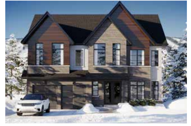
ELEVATION D 2,987 SQ.FT