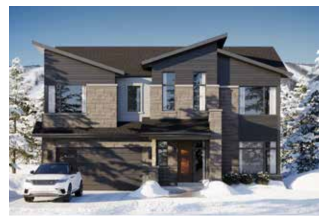
ELEVATION B 2,994 SQ.FT